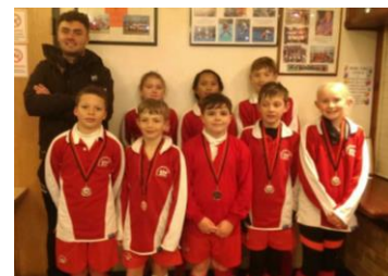
Springfield Hockey Team

There is a Girls League match Vs St.Micheal on Thursday 22nd November.