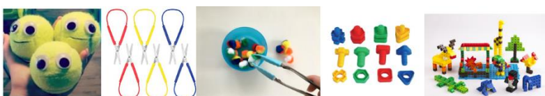
Developing your child's pencil grip: · Use a bulldog clip